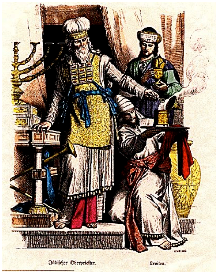
(Illustrations from Wikipedia)

The high priest had special elaborate clothing he was to wear as he ministered to the Lord. (Exodus 28).